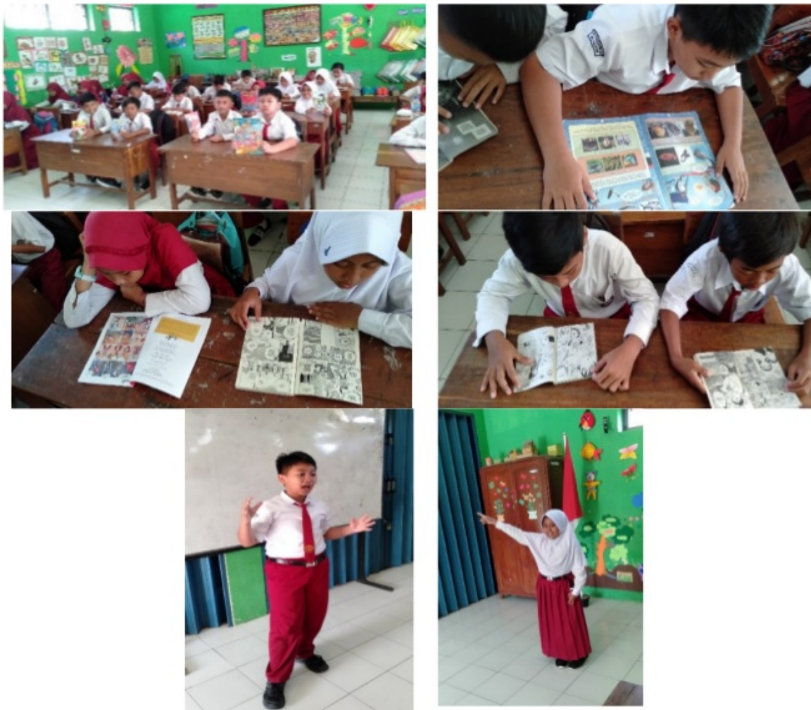
Figure 2. The Learning Process with Comic media