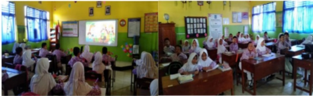
Figure 2. The Learning Process with Animated Video Media